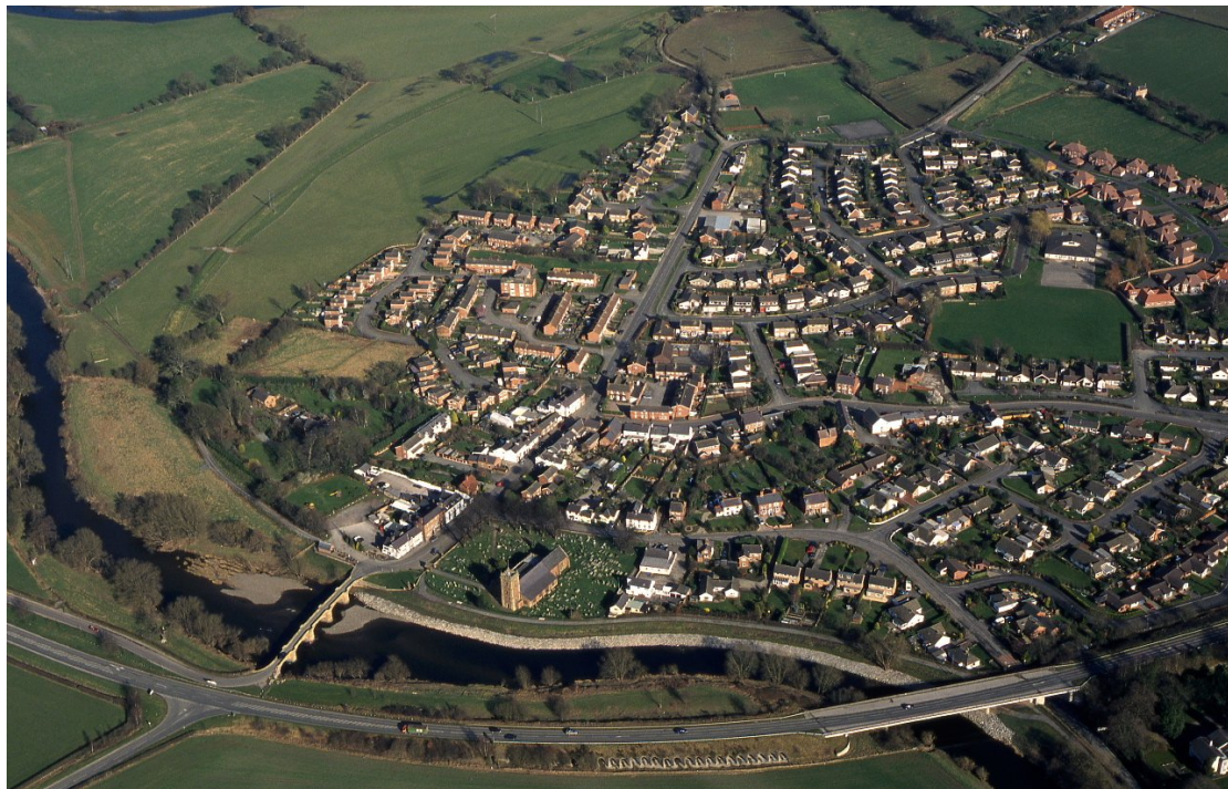
Bangor-is-y-coed, photo 04-c-0020

The church of St Dunawd (102683) incorporates 14 th and 15 th -century work in the fabric of the west wall of the nave, and the chancel, including windows and such internal features as the roofs. Further additions were made in the early 18 th century when the tower was completely rebuilt, and the aisles in the 19 th century, with the porch being added in 1877. Most of the interior fittings are post-medieval but there is a late medieval font, fragmentary stained glass a 14 th -century sepulchral slab (the only in-situ survivor of several known to have been found in the churchyard), and some of the beams from the medieval rood screen. The churchyard is rectangular – a detailed measured survey of all the grave markers was completed some years ago.