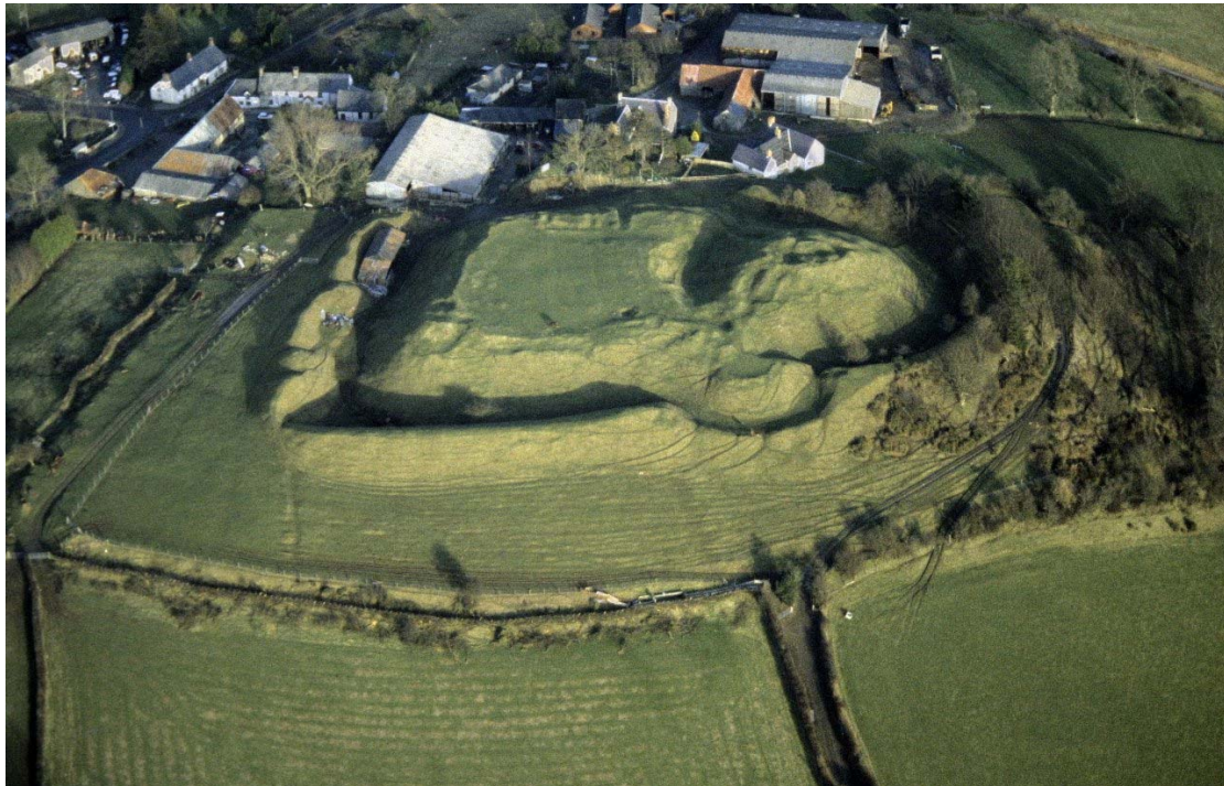
Paincastle motte and bailey castle, photo 94-C-0042, © CPAT, 2011

We have not referenced the sources that have been examined to produce this report, but that information will be available in the Historic Environment Record (HER) maintained by the Clwyd-Powys Archaeological Trust. Numbers in brackets are primary record numbers used in the HER to provide information that is specific to individual sites and features. These can be accessed on-line through the Archwilio website ( www.archwilio.org.uk ).