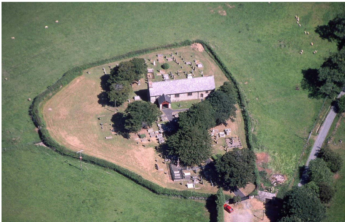
Llansantffraed in Elwel church, photo 95-C-0330

We have not referenced the sources that have been examined to produce this report, but that information will be available in the Historic Environment Record (HER) maintained by the Clwyd-Powys Archaeological Trust. Numbers in brackets are primary record numbers used in the HER to provide information that is specific to individual sites and features. These can be accessed on-line through the Archwilio website ( www.archwilio.org.uk ).