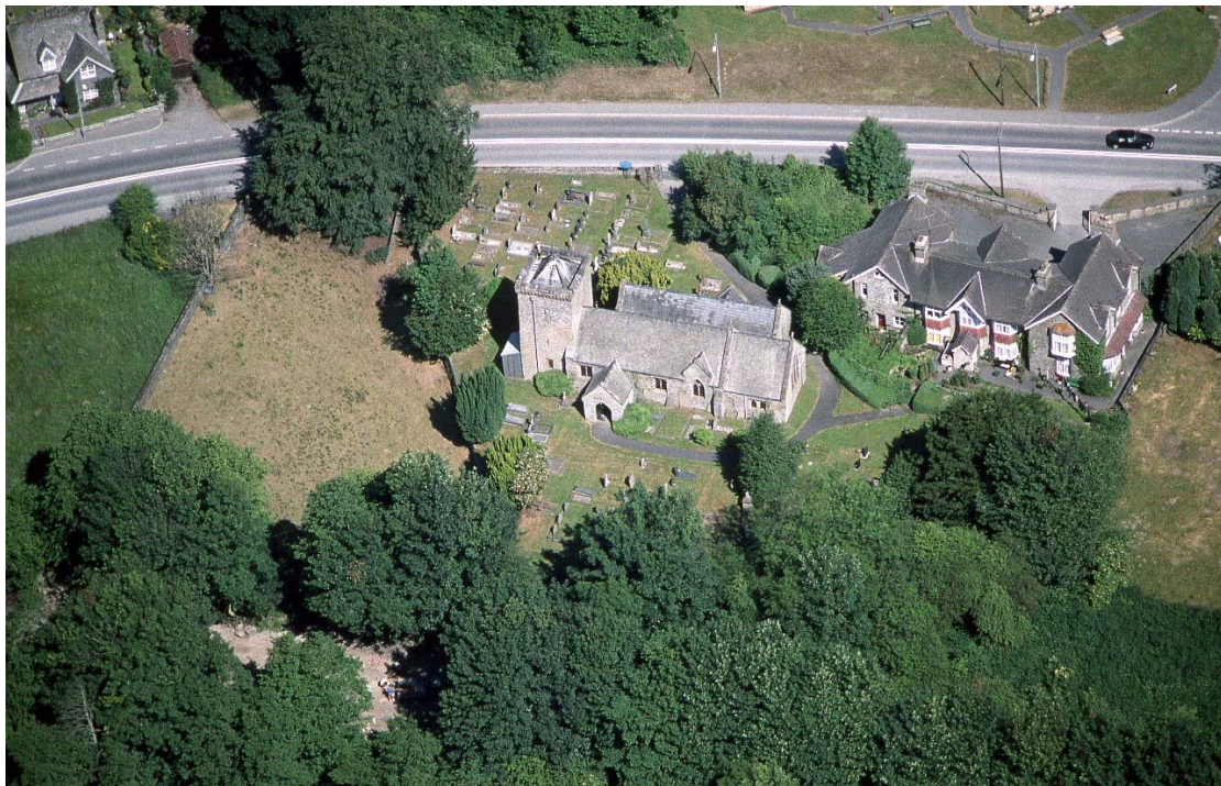
Llanelwedd church, photo 95-C-0607

We have not referenced the sources that have been examined to produce this report, but that information will be available in the Historic Environment Record (HER) maintained by the Clwyd-Powys Archaeological Trust. Numbers in brackets are primary record numbers used in the HER to provide information that is specific to individual sites and features. These can be accessed on-line through the Archwilio website ( www.archwilio.org.uk ).