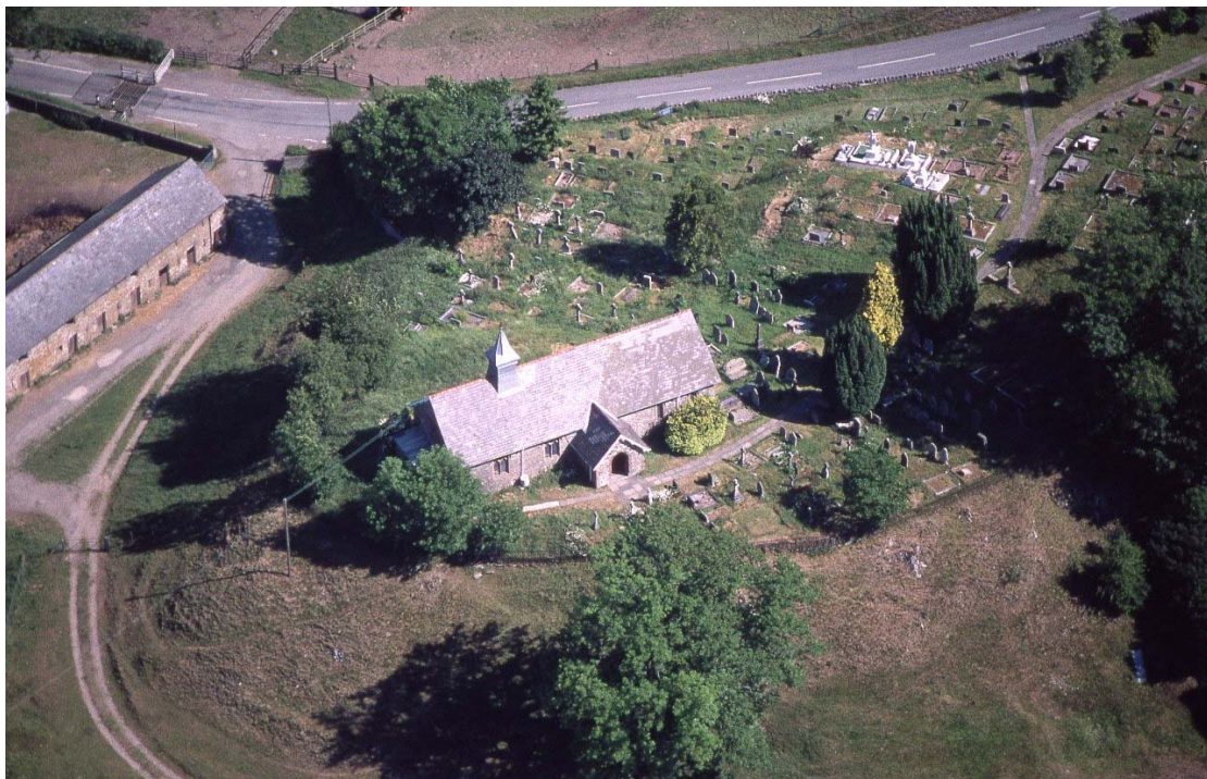
Llandrindod church, photo 95-C-0607

We have not referenced the sources that have been examined to produce this report, but that information will be available in the Historic Environment Record (HER) maintained by the Clwyd-Powys Archaeological Trust. Numbers in brackets are primary record numbers used in the HER to provide information that is specific to individual sites and features. These can be accessed on-line through the Archwilio website ( www.archwilio.org.uk ).