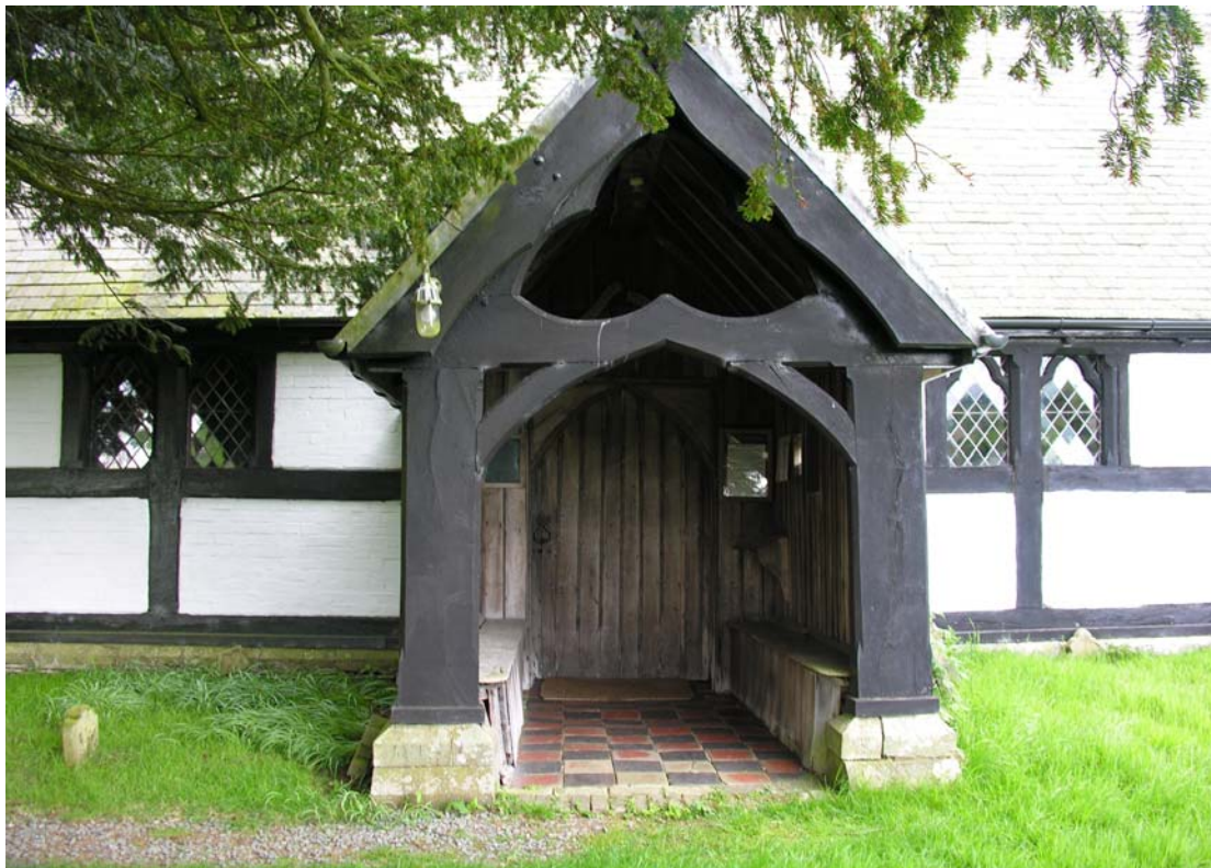
Trelystan Church, photo 2425-0005

We have not referenced the sources that have been examined to produce this report, but that information will be available in the Historic Environment Record (HER) maintained by the Clwyd-Powys Archaeological Trust. Numbers in brackets are primary record numbers used in the HER to provide information that is specific to individual sites and features. These can be accessed on-line through the Archwilio website ( www.archwilio.org.uk ).