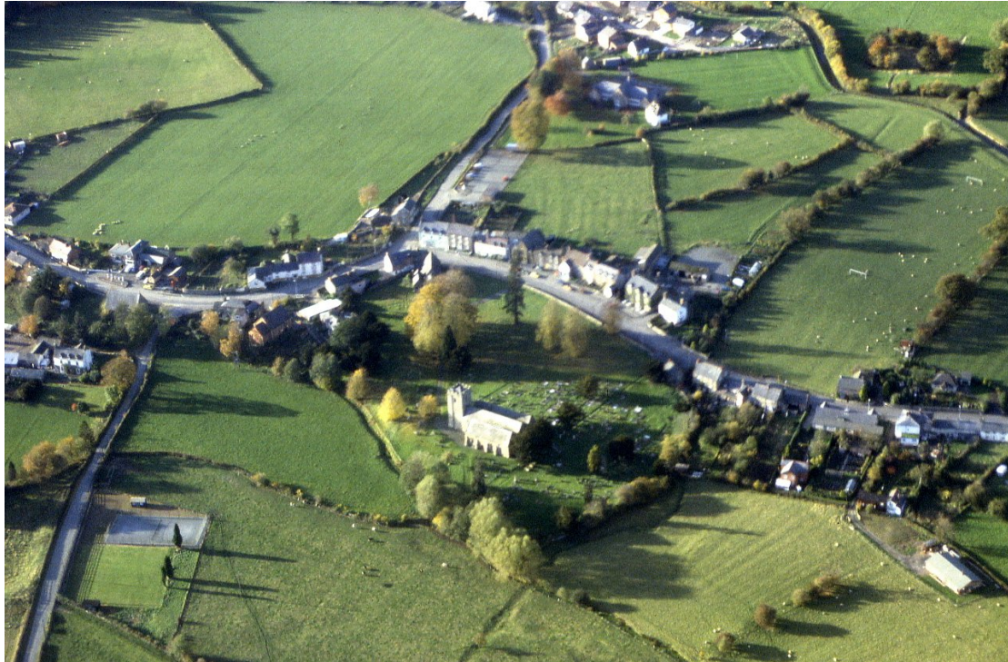
Meifod, photo 80-c-0261

The nature and development of the settlement here through the Middle Ages has yet to be established. It could be argued with equal validity that the church might have occupied a solitary location through the medieval era, or alternatively that people could have gravitated to it, thus creating a nucleated settlement. Either is plausible.