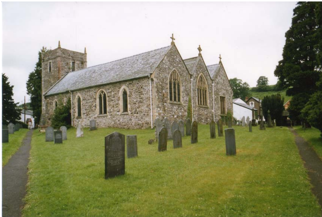
The church at Llanrhaeadr-ym-Mochnant, photo 0614-0019