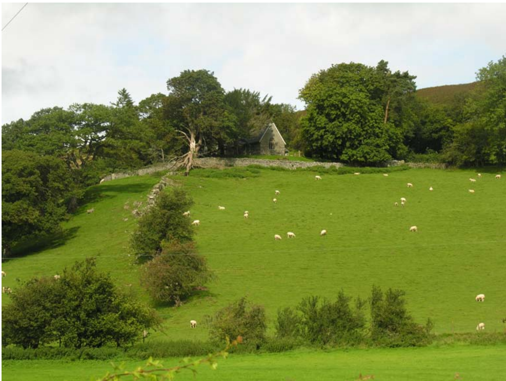
Garthbeibio church, photo 021

We have not referenced the sources that have been examined to produce this report, but that information will be available in the Historic Environment Record (HER) maintained by the Clwyd-Powys Archaeological Trust. Numbers in brackets are primary record numbers used in the HER to provide information that is specific to individual sites and features. These can be accessed on-line through the Archwilio website ( www.archwilio.org.uk ).