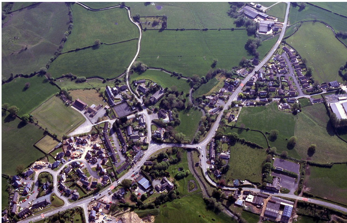
Churchstoke, photo 01-c-0106

We have not referenced the sources that have been examined to produce this report, but that information will be available in the Historic Environment Record (HER) maintained by the Clwyd-Powys Archaeological Trust. Numbers in brackets are primary record numbers used in the HER to provide information that is specific to individual sites and features. These can be accessed on-line through the Archwilio website ( www.archwilio.org.uk ).