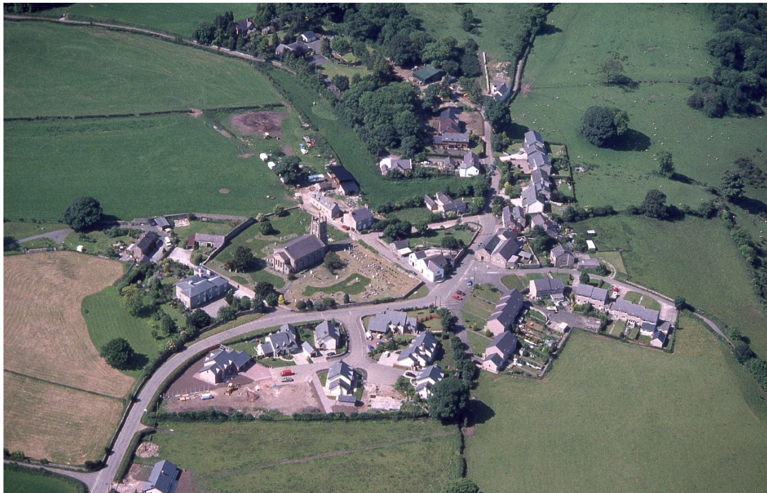
Ysceifiog, photo 95-c-0177, © CPAT, 2012

We have not referenced the sources that have been examined to produce this report, but that information will be available in the Historic Environment Record (HER) maintained by the Clwyd-Powys Archaeological Trust. Numbers in brackets are primary record numbers used in the HER to provide information that is specific to individual sites and features. These can be accessed on-line through the Archwilio website ( www.archwilio.org.uk ).