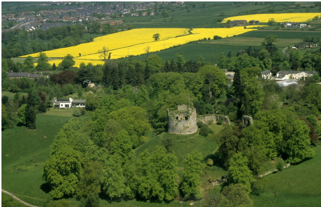
Hawarden Castle, photo 87-c-0101

We have not referenced the sources that have been examined to produce this report, but that information will be available in the Historic Environment Record (HER) maintained by the Clwyd-Powys Archaeological Trust. Numbers in brackets are primary record numbers used in the HER to provide information that is specific to individual sites and features. These can be accessed on-line through the Archwilio website ( www.archwilio.org.uk ).