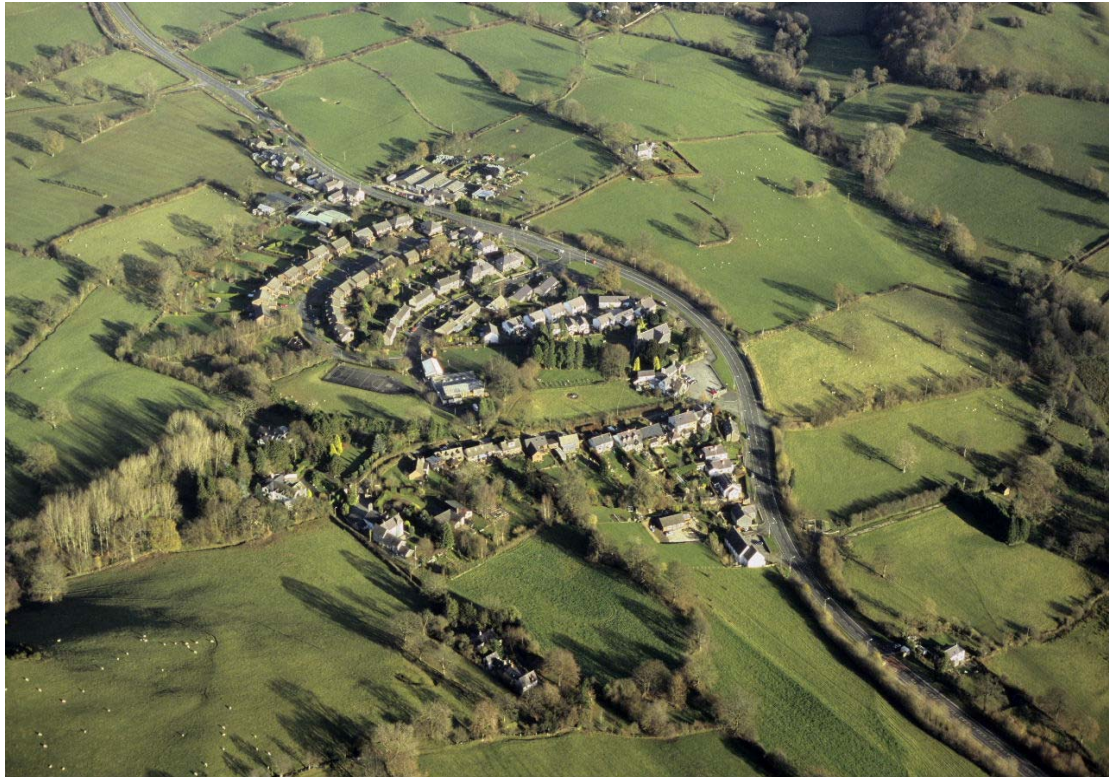
Llanferres, photo 08-C-0238