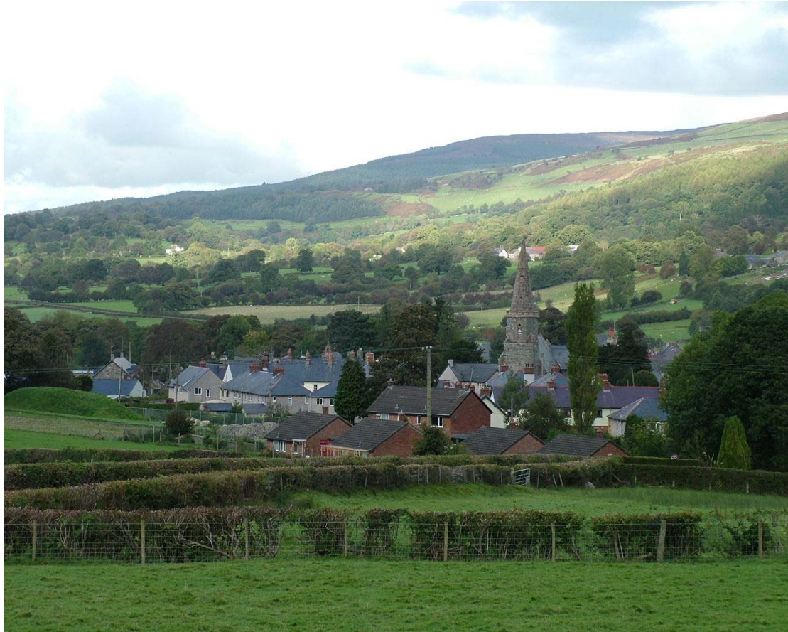
Llandrillo, photo 1766-0462

development, though this is not perhaps surprising as from the 1760s, the village lay on the turnpike road from Corwen to Bala and beyond.