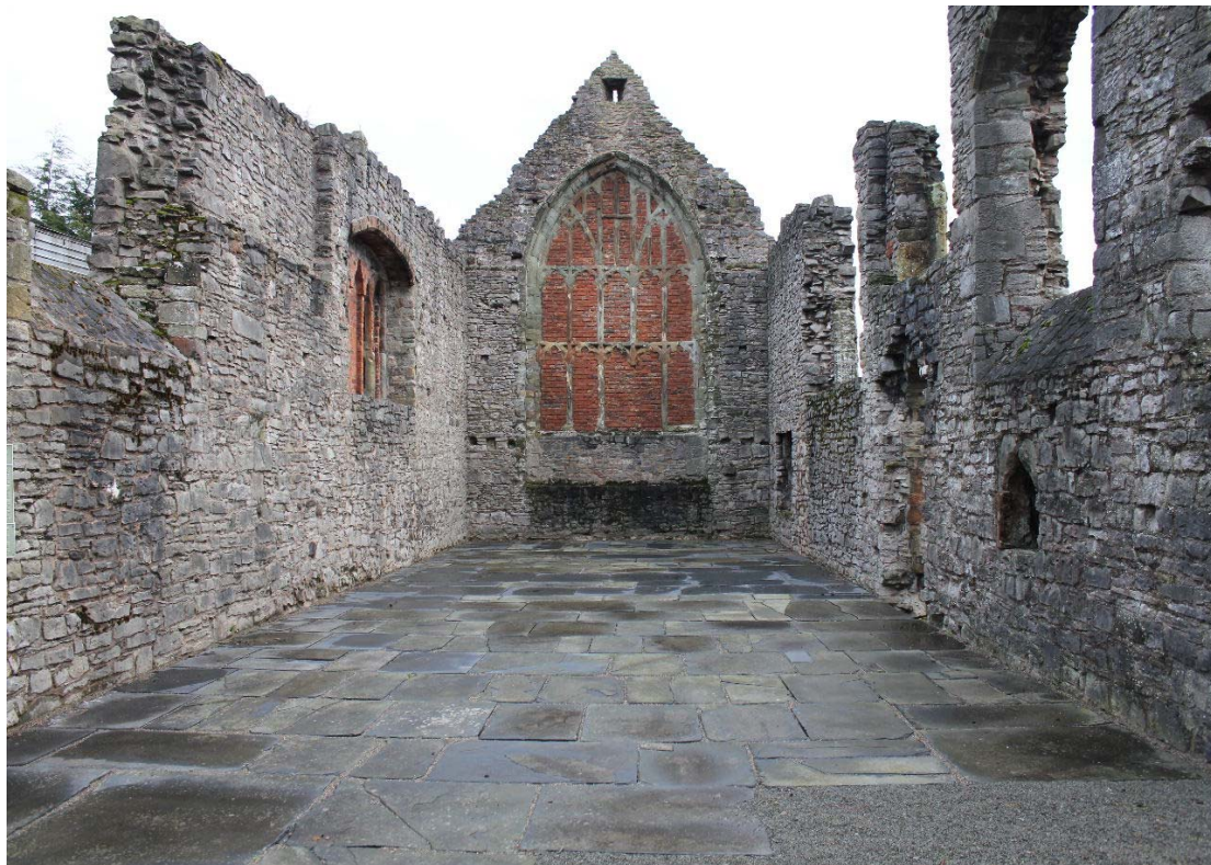
Denbigh Friary, photo 3025-0020

The Earl of Leicester's church (102018) was begun by Robert Dudley in 1578 (on the basis of a foundation stone), but was abandoned soon after his death in 1588. Though later used as a stone quarry, substantial parts remain, and it is considered a unique example of major church building in the Elizabethan era.