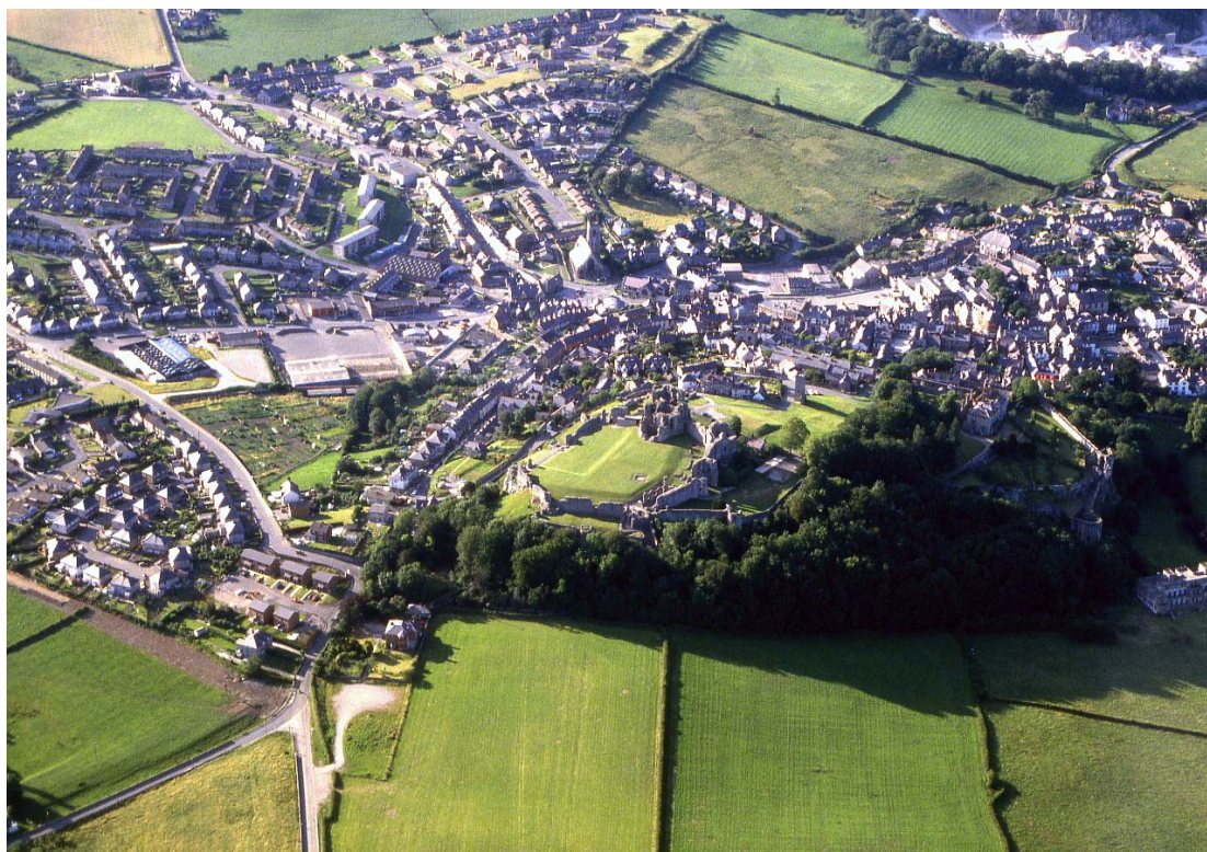
Denbigh castle and town, photo 85-C-0307

A demesne manor was also established near to the castle, though its chronology is not recorded in the same level of detail as the stronghold. It included two granges, a byre, a dovecote and two fishponds, extending over 75 acres.