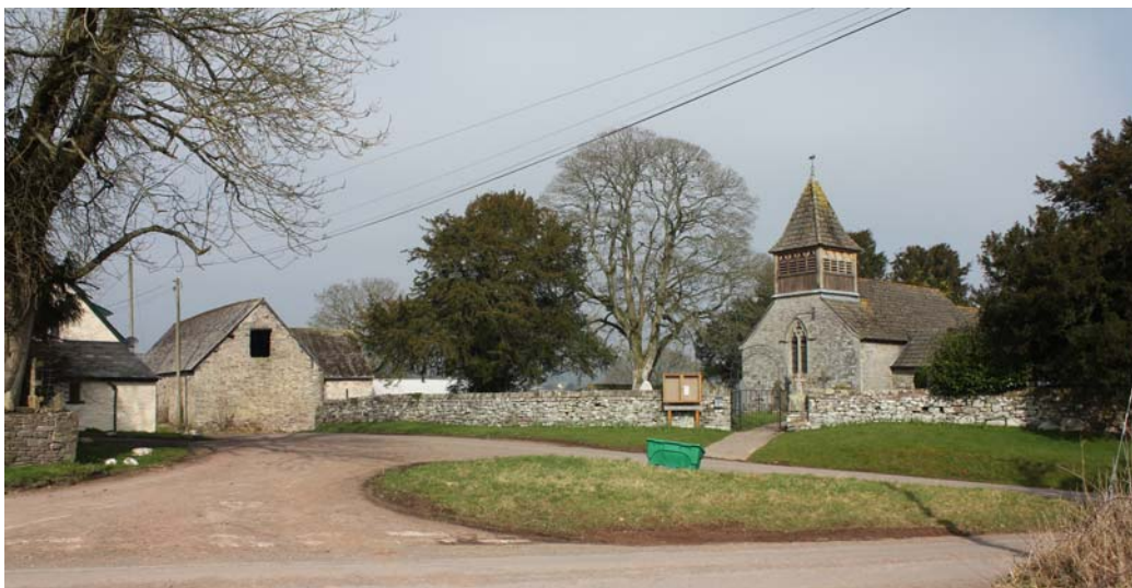
Talachddu church, photo 3247-0034

We have not referenced the sources that have been examined to produce this report, but that information will be available in the Historic Environment Record (HER) maintained by the Clwyd-Powys Archaeological Trust. Numbers in brackets are primary record numbers used in the HER to provide information that is specific to individual sites and features. These can be accessed on-line through the Archwilio website ( www.archwilio.org.uk ).