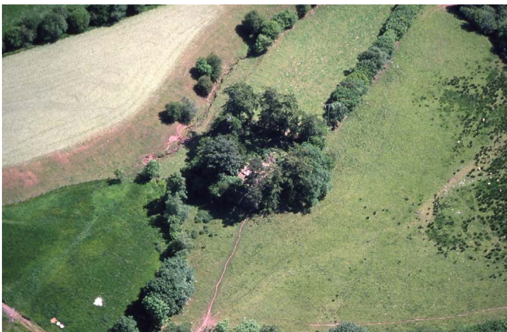
Remains of Llangynog church, photo 95-C-0399 © CPAT 2011

We have not referenced the sources that have been examined to produce this report, but that information will be available in the Historic Environment Record (HER) maintained by the Clwyd-Powys Archaeological Trust. Numbers in brackets are primary record numbers used in the HER to provide information that is specific to individual sites and features. These can be accessed on-line through the Archwilio website ( www.archwilio.org.uk ).