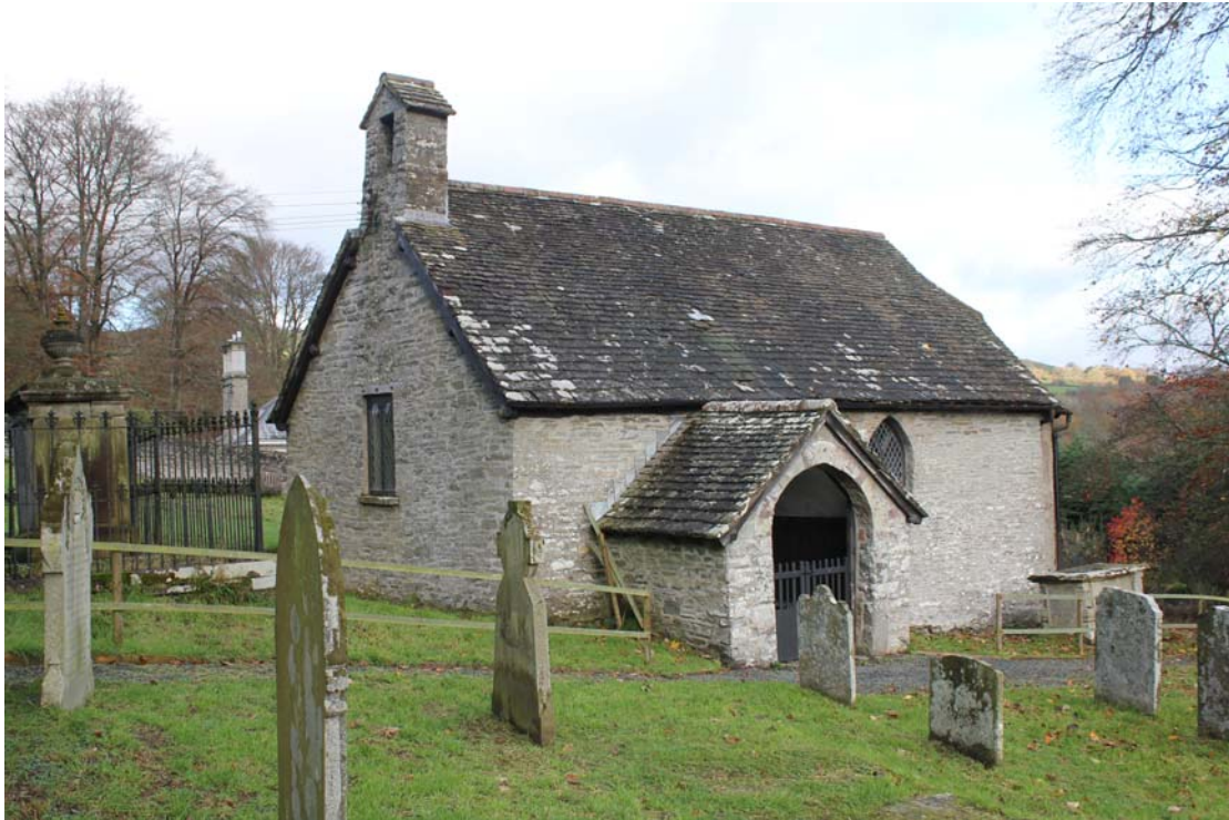
Alltmawr Church, photo 1215

We have not referenced the sources that have been examined to produce this report, but that information will be available in the Historic Environment Record (HER) maintained by the Clwyd-Powys Archaeological Trust. Numbers in brackets are primary record numbers used in the HER to provide information that is specific to individual sites and features. These can be accessed on-line through the Archwilio website ( www.archwilio.org.uk ).