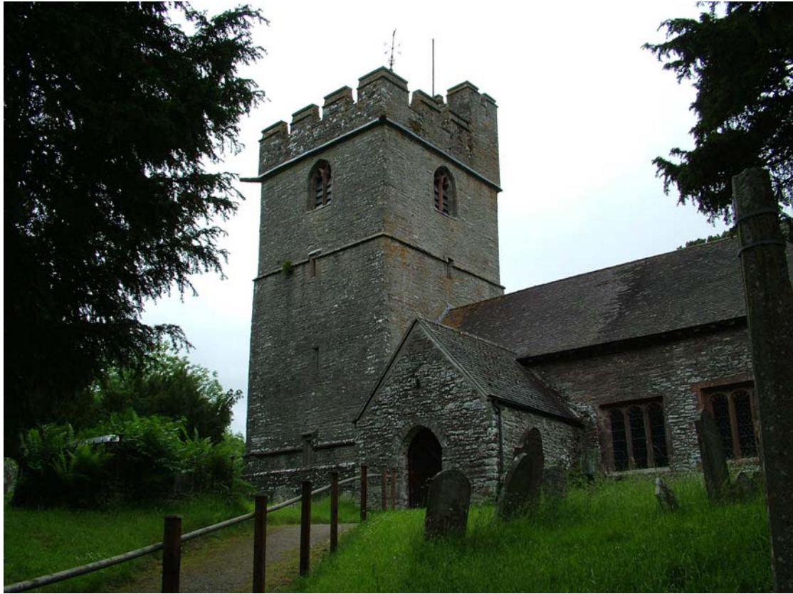
Llanfeugan Church, photo 1938-0032

The churchyard's shape, an irregular quadrilateral, is dictated by the spur on which it sits. The base and shaft of the churchyard cross remain, and the faint traces of a supposed cockpit, west of the church.