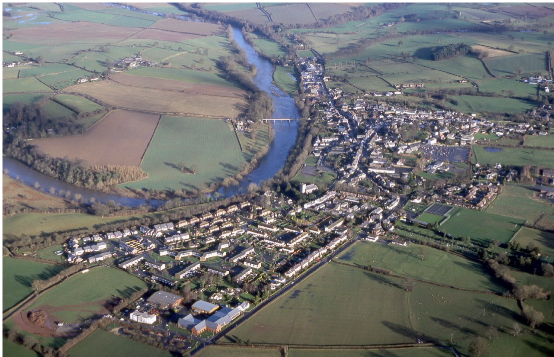
Hay-on-Wye, photo 00-c-0085 © CPAT, 2013

The town layout displays some degree of planning though hardly to a classic pattern, for there were topographical constraints. Three main thoroughfares provide the framework of the street system in Hay. Broad Street and its continuation ran from the Water Gate in the north to the West Gate in the south-west, while Lion Street and Heol y Dwr ran eastwards and south-eastwards respectively from Broad Street to the East Gate. Originally, a large market-place lay in front of the castle, but this is now occupied by buildings off Market Street and High Town. The present market hall dates from 1835 but its predecessor was a structure of 17 th -century date.