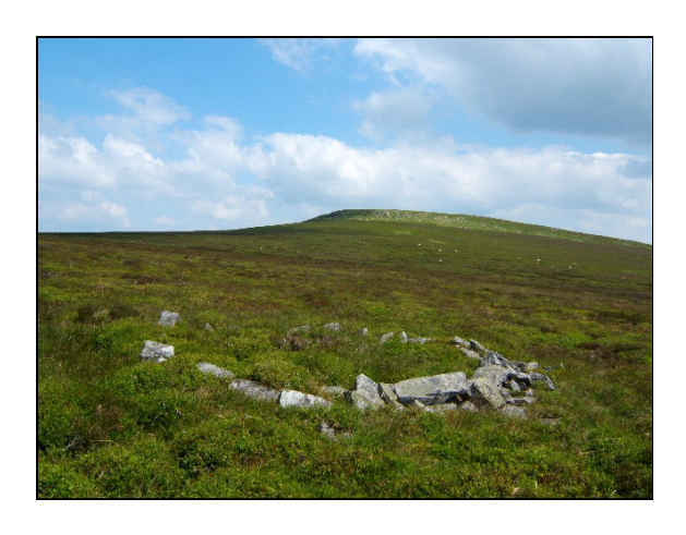
Possible prehistoric hut below Pen Cerrig-calch

Follow the path E then SE along the plateau edge. At SO 2097022864 take the narrow path on the right which continues close to the edge, passing two circles of stones (8) on the left represent which may prehistoric roundhuts (at SO 21012279 and SO 21052271). Return to the main track and continue back to the summit of Pen Cerrig-calch, then retrace the outward path across the summit. Descending towards Crug Hywel hillfort there are a number of path options which will take you back to the field gate at Perth-y-Pia.