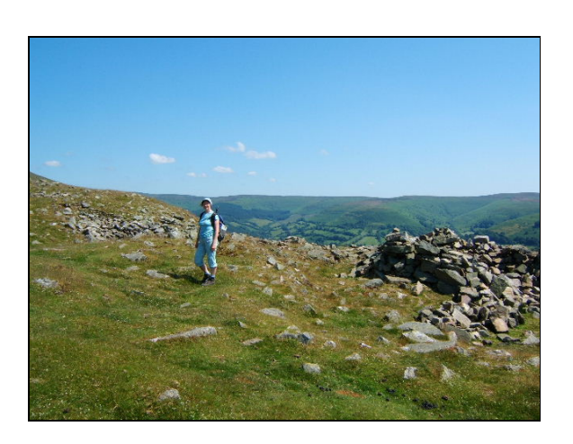
Iron Age hut near the entrance to Crug Hywel Hillfort

Walk along the road, passing Ty Mawr, and follow the signed route for Table Mountain and Perth-y-Pia along a concrete track. At Perth-y-Pia cross the