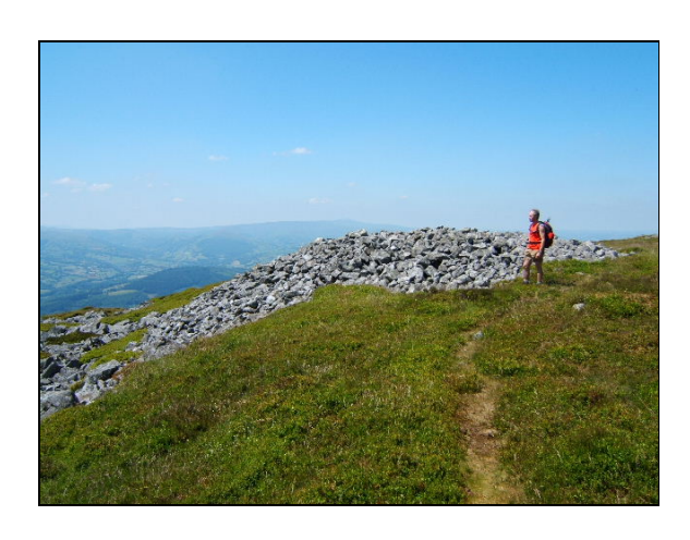
Burial cairn on Pen Cerrig-calch

From the trig point (SO 21708222361) a short detour to the SSE leads to an impressive Bronze Age burial cairn (2) at SO 2175222233. Return to the trig point and continue to a second burial cairn (3) , now remodelled into a shelter (SO 21662241).