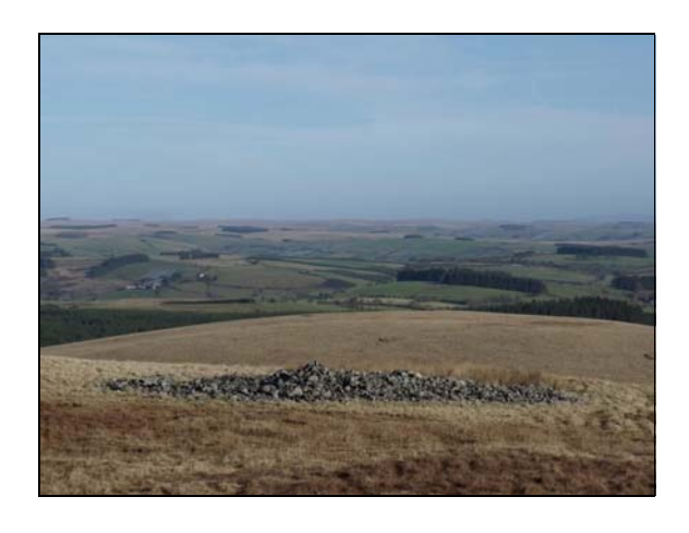
The large burial cairn (4) on Garn Lâs

From the cairn there is the option of extending the walk to include an ascent of Fan Foel, before returning to the cairn to continue to the stone circles. The ascent should only be undertaken in