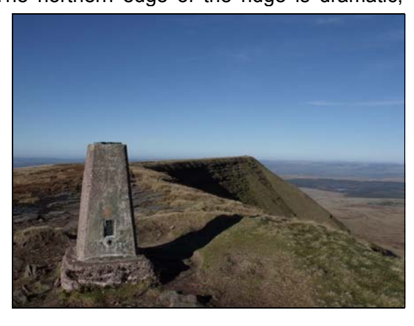
The summit of Fan Brycheiniog looking towards Tŵr y Fan Foel

From the cairn the walk heads W, following the N side of a fenced enclosure (no path) to a corner with a gate at SN 82322492. From this point head NNW, downslope, to a standing