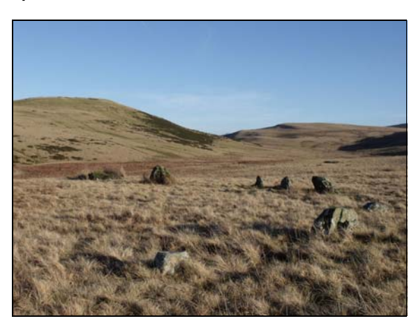
The western stone circle (11) at Nant Tarw with Foel Darw on the left and Twyn Perfedd on the right

Around 100m to the W is a very large block of sandstone with two small upright stones to one side (SN 8176625878). The large stone may once have been upright, forming the end of a short stone row (12) .