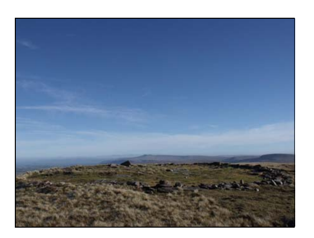
The excavated burial cairn (6) on Fan Foel

The final ascent of the ridge is steep and can be slippery, particularly during the descent. On reaching the summit of Fan Foel the path leads to a large burial cairn (6) (SN 82142234) which was partially excavated by the Dyfed Archaeological Trust in 2004. The excavations uncovered a kerb of stones around 11m in diameter surrounding a low stone cairn with a stone cist near the centre. The cist contained the cremated remains of an adult, a child and an infant, together with pottery and flint tools. A secondary cremation was also uncovered nearby, consisting of an adult and a juvenile.