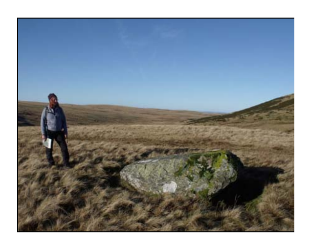
The possible fallen standing stone (1)

Bear left and continue parallel to the forestry, avoiding the reeds, to join a rough track. Follow this S, passing the corner of the forestry and descending to a stream. Ascend the opposite bank heading SW, following vehicle tracks to reach a large stone slab which may be a fallen standing stone (1) (SN 8283925563).