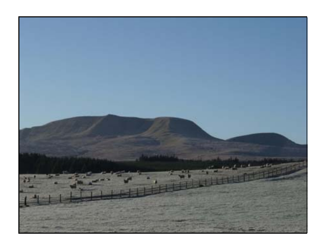
Fan Brycheiniog and Fan Foel viewed from the north

The Brecon Beacons as a whole has a wealth of archaeological sites and both Fan Foel and Tŵr y Fan Foel have Bronze Age burial cairns on their summits. The moorland which stretches north towards the Usk Reservoir is particularly rich in important prehistoric sites, the most impressive sites of which