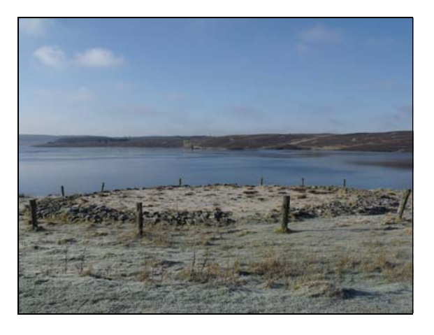
The Bronze Age ring cairn (1)

The walk starts from the carpark on the north-east side of Llyn Brenig, at the end of the tarmac road (SH 98325741). From the carpark go over the stile to an information board for the Archaeology Trail. Follow the track S for 180m to reach the large and impressive Bronze Age ring cairn (1) on the right of the track (SH 98345720). The cairn dates from around 2000-1500 BC and was originally built as a ceremonial monument consisting of a stone ring surrounded by a circle of posts. Later on a cremation was placed in the centre of the ring and two more on the side.