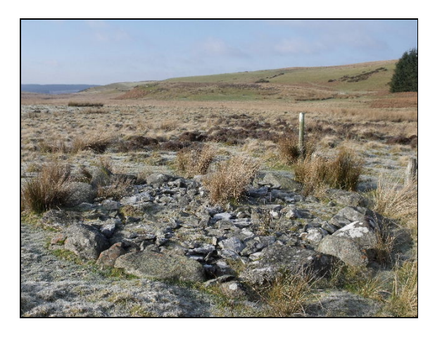
The Bronze Age kerb cairn (6)

The trail then returns past Hen Ddinbych and heads W to another Bronze Age burial cairn (7) which is surrounded by a kerb of large boulders.