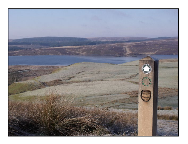
One of the waymarkers on the Brenig Archaeology Trail

The Brenig reservoir was built between 1973 and 1976 to provide water supplies to north-east Wales. The earthen dam is around 40m high and forms a reservoir 1.1km long, 150m across and up to 45m deep. The creation of the reservoir submerged a Bronze Age round barrow and several medieval and later farmsteads. The surrounding landscape largely is heather moorland but includes some fields of improved pasture, within which there is an important complex of Bronze Age burial and ritual sites as well as medieval and later summer houses, or 'hafotai', and farmsteads.