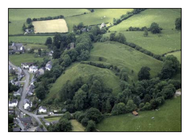
Aerial view of New Radnor Castle

From Broad Street walk uphill to the junction with High Street and turn left, then taking a lane on the right, rising behind the War Memorial, which leads to the St Mary's Church 1 , which was built in 1845. Continue along the south side of the church and through a gate leading to New Radnor Castle 2 .