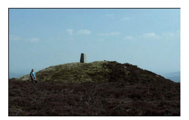
The Bronze Age barrow on the summit of Bache Hill

Return to the track, noting a third burial mound on the skyline to the north-east which will be visited later. Unfortunately, the intervening fields have no public access. Turn left and follow the track to the north-west. On reaching a junction boundaries at a saddle (SO of 20546381) cross the first stile on the right, next to a gate, and turn right alongside a pond to follow the edge of the forestry. Go through the gate at the far end of the field and turn right, leaving the bridleway, to follow the fenceline southwards.