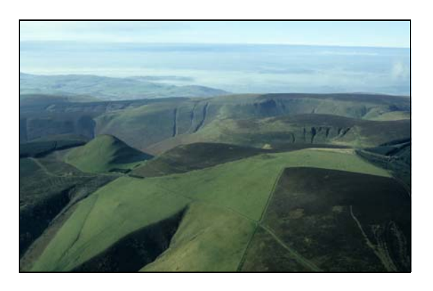
Aerial view of Bache Hill and Whinyard Rocks with the Whimble to the left

Take the track on the left, around the edge of the forestry, leading to a gate into a field, from where the path follows the forest edge. As the ground levels at the end of the forestry, continue along the track which starts to descend. Unfortunately, there is no public access to Whimble, the prominent hill which overlooks the forestry from the north. On the left is Harley Dingle which is used as a live firing range. At the end of the track (SO 20476296) go through a gate and turn right to follow another track around the base of Whinyard Rocks.