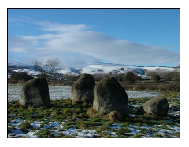
The stone circle at Four Stones

This is an area of considerable significance in its grouping and variety of archaeological sites, but is best known for its prehistoric monuments. Unfortunately, many of these have been levelled by centuries of ploughing and were only discovered from the air as cropmarks in dry summers. The earliest evidence of activity consists of scatters of flints dating to the Mesolithic (10,000 - 4,300 BC) and Neolithic (4,300 -2,300 BC) periods, although it is the complex of large-scale Neolithic monuments for which this area is best known. Clustered around Hindwell and Walton village are the buried remains of