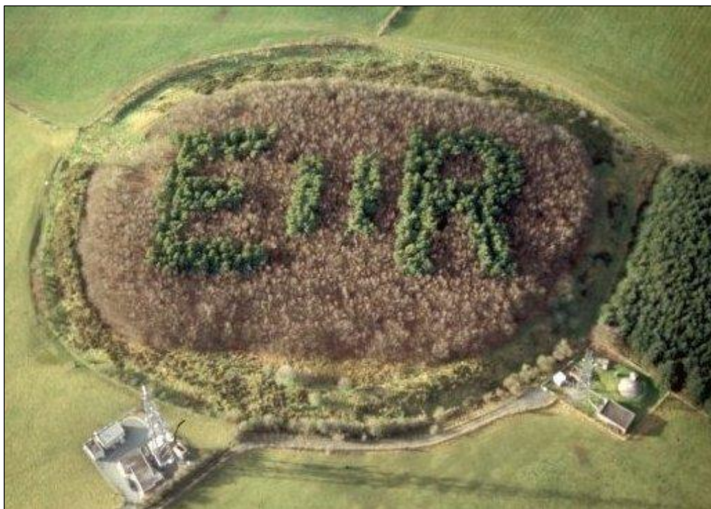
Figure 1: Beacon Ring Hillfort from the air, currently owned by Clwyd-Powys Archaeological Trust.

Please use the form at https://cpat.org.uk/docs/HER-Docs/new_her_enquiry.htm to submit your enquiry.