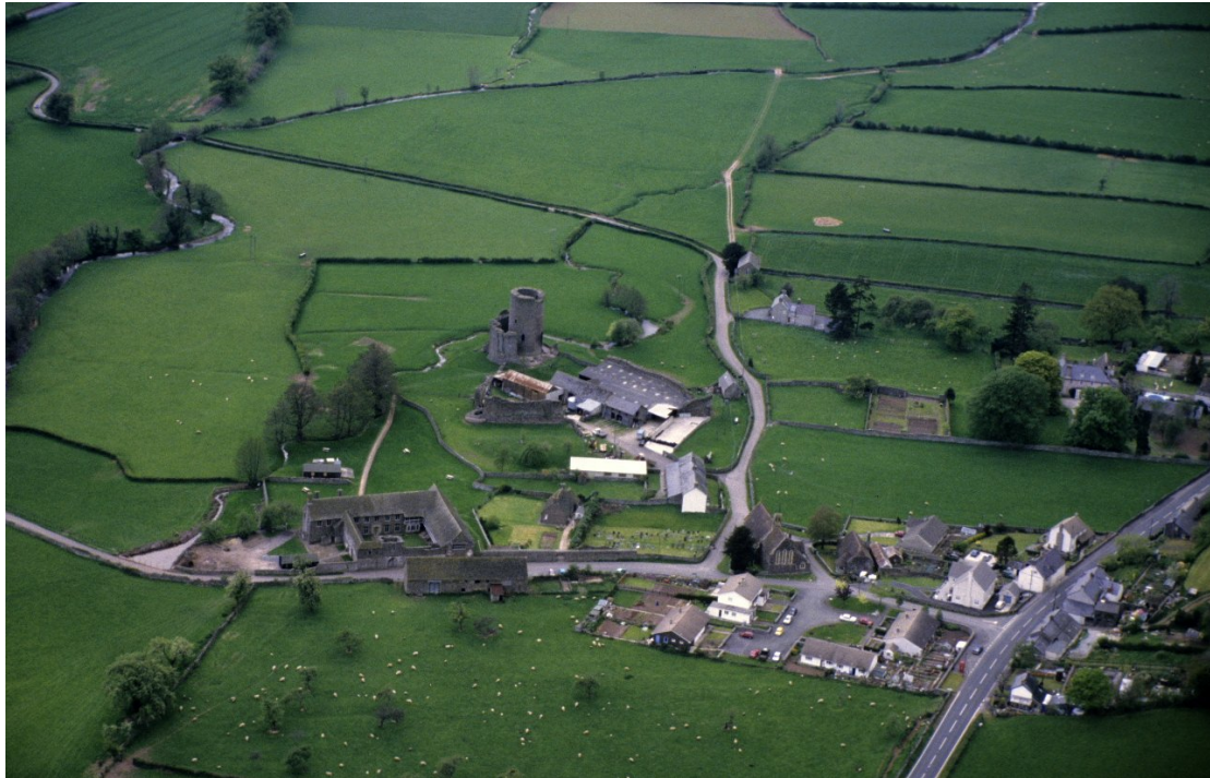
Tretower, photo 87-c-0083 © CPAT, 2013

The village presumably developed only gradually after the Reformation, Leland at that time calling it ‘a smaulle village standing on a little brooke’. It did not become a town in the way that Crickhowell or Talgarth did. Instead it remained small and compact, with little to attract the passing observer whose attention (if Richard Fenton at the beginning of the 19 th century is a reliable guide) was drawn to the castle and the court. There are probably now fewer houses here than in the time of the first Queen Elizabeth.