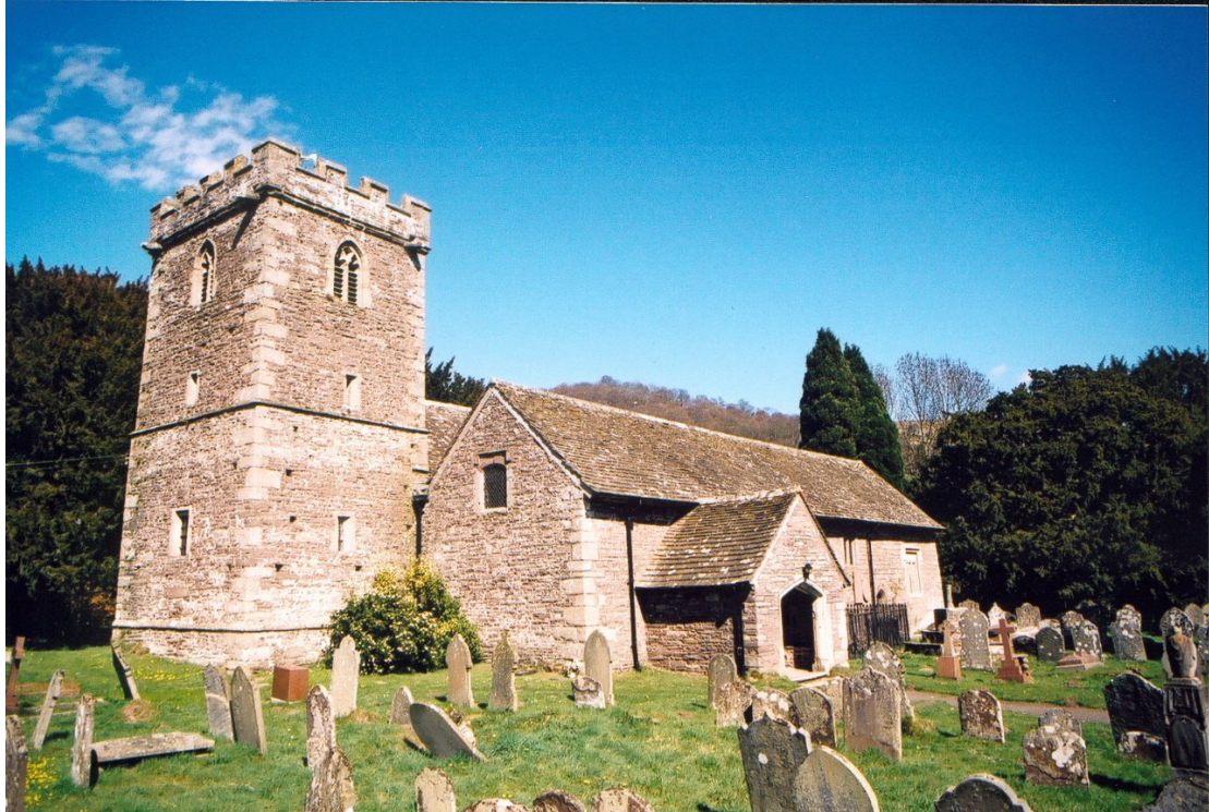
Llanbedr Church, photo 1345-0008

The church dedicated to St Peter appears largely to be of late 15 th - or early 16 th -century build on the basis of the south aisle and its accompanying chapel, though it is possible that the nave and chancel are earlier. The tower, too, could be earlier, perhaps 14 th -century, although there is no architectural detail to confirm this. There was some rebuilding in 1897, following restorations in 1868 and 1883.