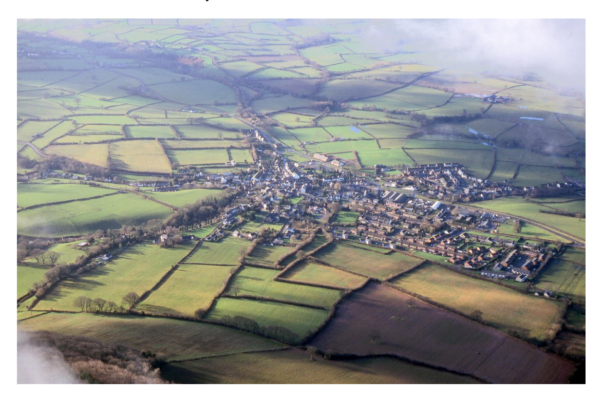
Talgarth, photo 00-c-0173

Of its subsequent development (or lack of it) little is known, though the fact that in 1309 thirteen burgage plots were unoccupied may suggest that the borough was already exhibiting signs of decline. National commentators had little to say about Talgarth in later centuries, though there is evidence that its market was still held. Lewis termed it a 'decayed borough', intimating that by the early 19<sup>th</sup> century only its fairs continued, but there is evidence for a market well into the 20<sup>th</sup> century.