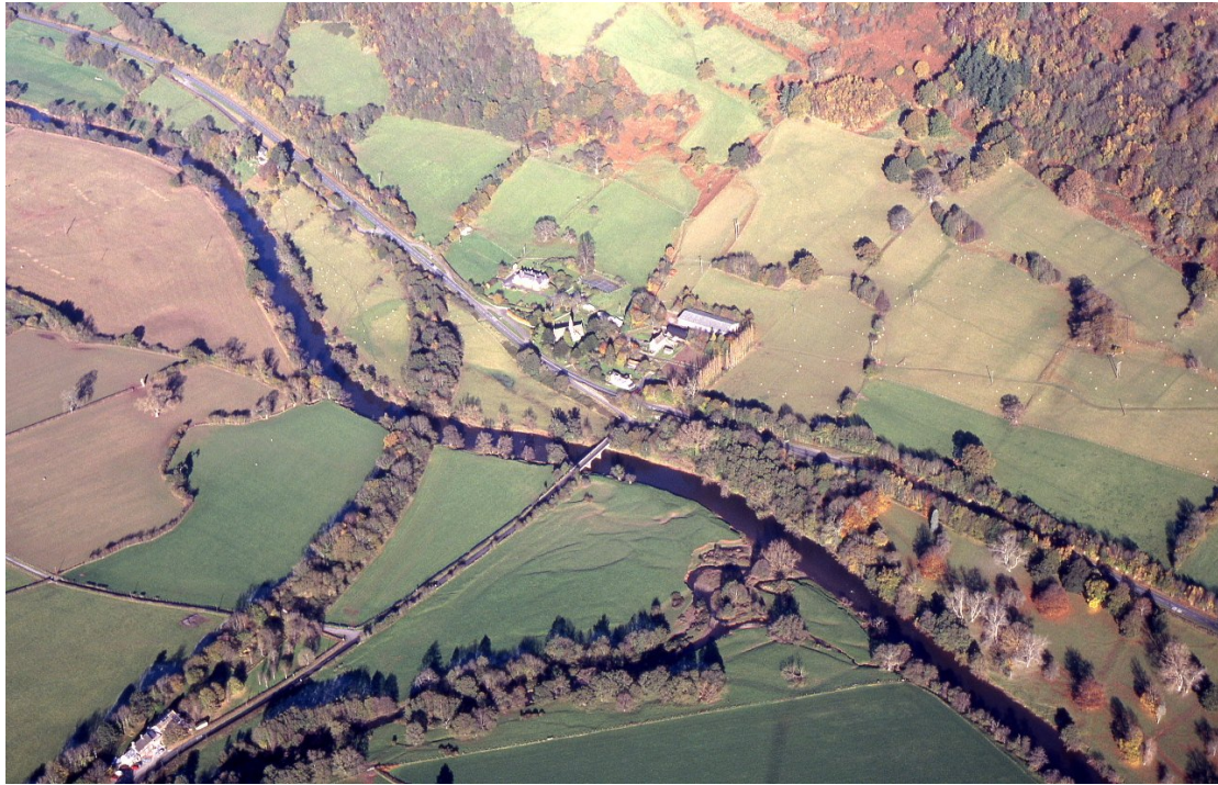
Llansantffraed, photo 05-c-0200

Llansantffraed House is thought to have had an 18 th -century origin, but was extensively remodelled in the 19 th century.