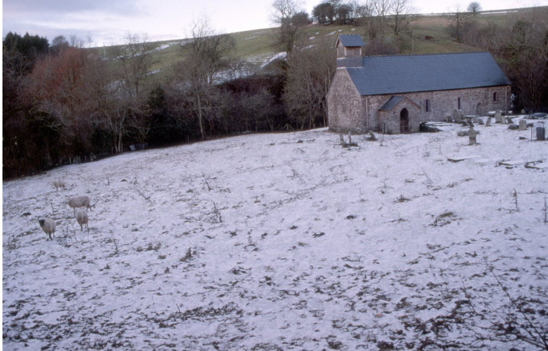
Church of St Elyw, photo cs03-007-0037

porch, and it seems very likely that these have been relocated from elsewhere in the churchyard. Inside, parts of an elaborate 14 th - or 15 th -century screen survive, there is a font, altar rails and a pulpit all post-Reformation, wall paintings of various types including a fragmentary late 17 th -century Royal Arms, and an interesting range of 18 th -century wall monuments.